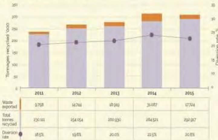
Tonnages recycled and diverted from landfill in SA - all plastics (2011 - 2015)