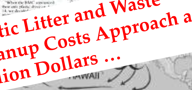
NORTH PACIFIC GYRE